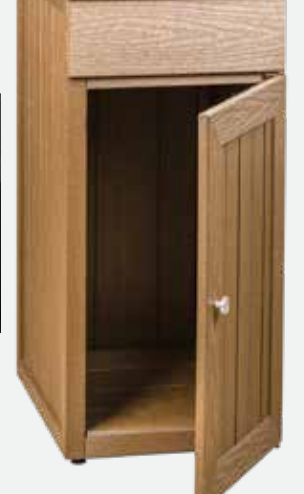
Spa Side Cabinet With sliding top All colors