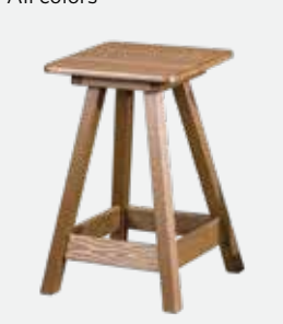
Bar Stool | 30"h Round or Square top All colors