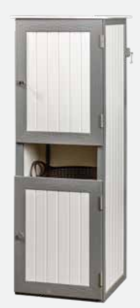
Towel Valet All colors