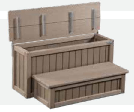
2-Tier Storage Step Up to 48" wide and all colors available