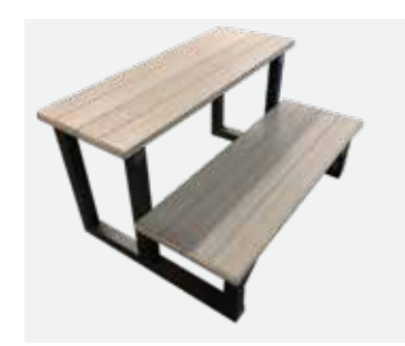
2-Tier ECO Step 30"w x 22"d x 16"h Black | Mocha Luxe Ash Luxe