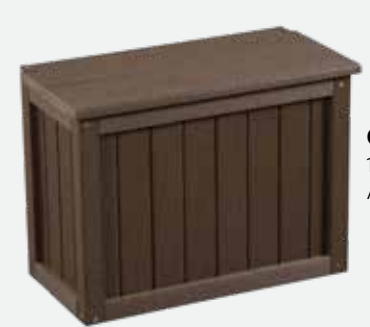
Chemical Cabinet 11"x 22"x 16" All colors